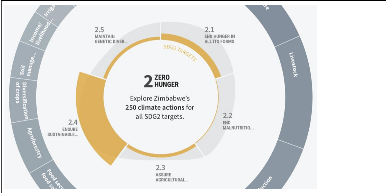
Figure 2: Zooming into individual SDGs – SDG 2 (“Zero Hunger”)