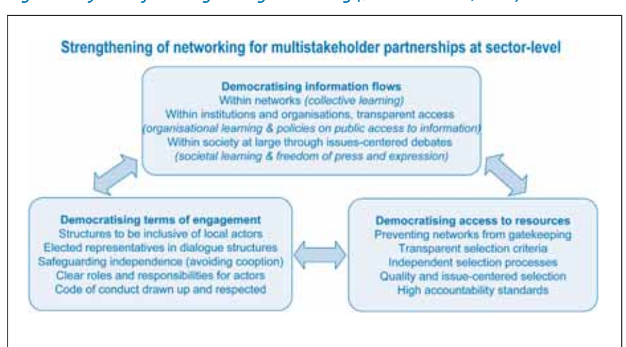
Figure 2. Key areas for strengthening networking (Ørnemark et al., 2006)

• Daring to share: Network members need to be open, and willing and able to learn from each other. This may seem obvious, but in practice members must have confidence in their work and 'dare to share' it with others (Padron, 1991). Networks cannot flourish without trust. In practice, this means that networks and partnerships are more likely to be effective if they are founded by groups or networks of people and organisations